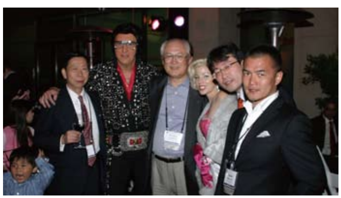
With Elvis and Marylin Monroe!