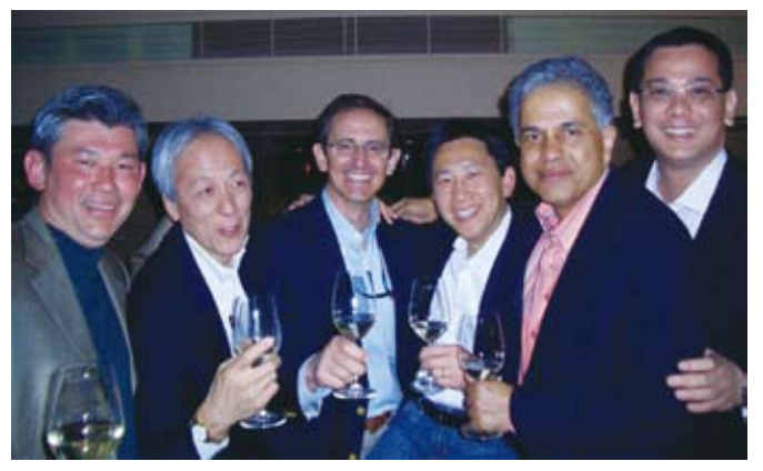
The WaDC with some of the usual suspects.

2000–01 Cross-Border Investment Vice-Chair 2002–05 Jurisdictional Council Member for Switzerland 2007–09 Deputy Committee Coordinator 2009–10 Deputy Committee Coordinator (extended for one year)