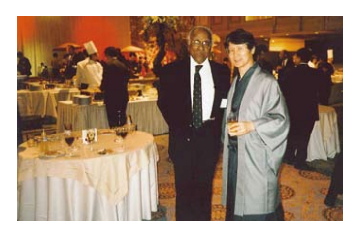
1994–95 International Construction Projects Committee Vice-Chair 2008–10 Publications Committee Vice-Chair