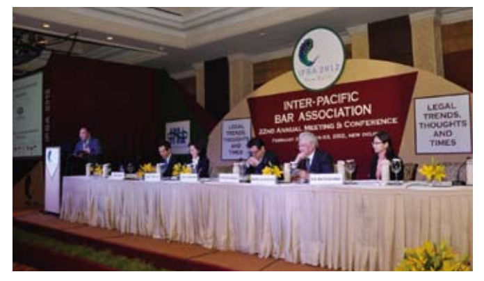
Collaboration between APEC and the IPBA is strong, with a joint session featuring prominent speakers held at every conference since Kyoto.