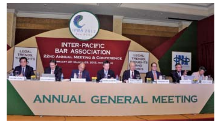
IPBA Officers leading the well-attended Annual General Meeting.