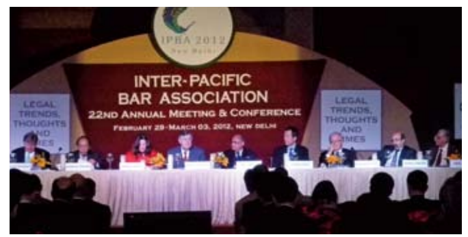
The Plenary Session panel discussing the prevailing situation of 'Life, Liberty & Law' in their respective jurisdictions.