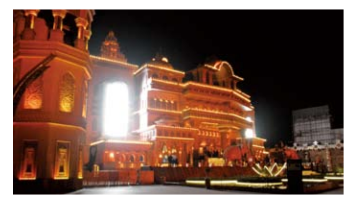
A cultural extravaganza was held at The Kingdom of Dreams.